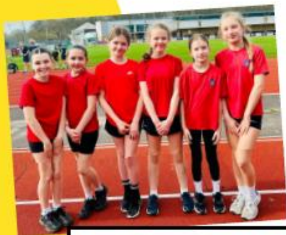
YEAR 6 TEAM

Our Year 3 boys and girls both secured 5th place, while the Year 4 girls came in 10th and the boys in 14th. The Year 5 girls finished 6th, and the boys placed 14th. The Year 6 girls also came 14th, with the boys finishing 9th. Well done to all the children who took part; they did St. Andrew's School proud!