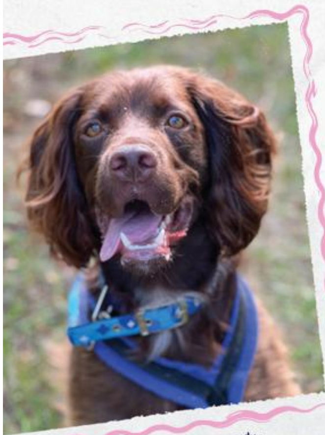
Brandy - Burford rehoming centre

Join our Paws to Draw competition for all ages and help raise awareness of homeless pets