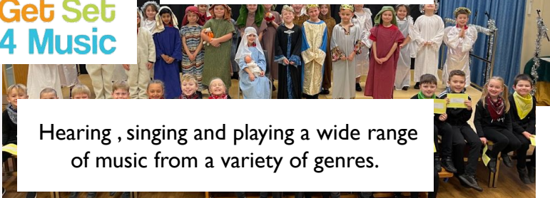
Hearing, singing and playing a wide range of music from a variety of genres.