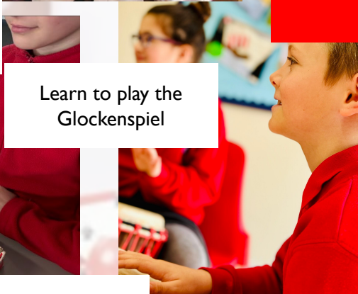
Learn to play the Glockenspiel