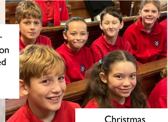
Christmas celebration at St Andrew's Church

Music subject leader completes annual action plan which is reviewed and shared with governors.