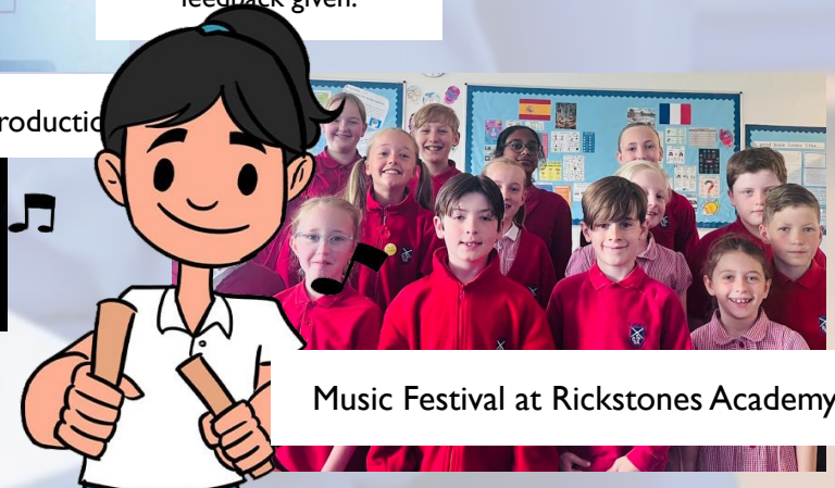
Music Festival at Rickstones Academy