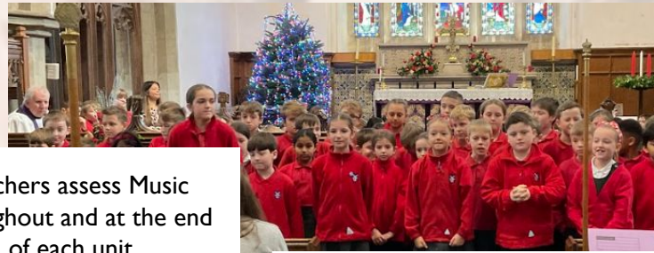
Teachers assess Music throughout and at the end of each unit.

Music subject leader completes annual action plan which is reviewed and shared with governors.