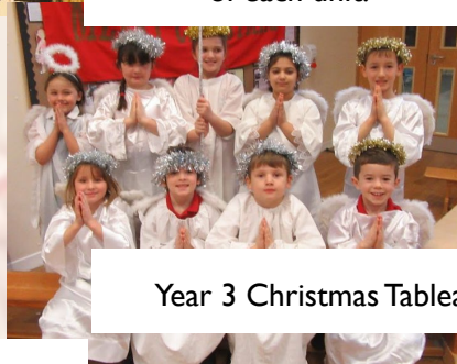
Year 3 Christmas Tableau