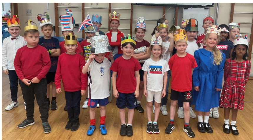
Jubilee Crown Contest Entries!