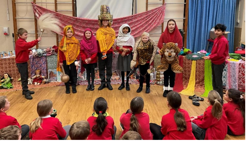
I loved fanning the teachers with a fan made out of a yak's tail.