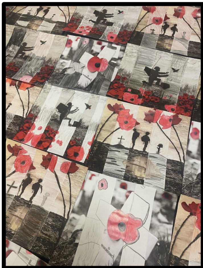
Year Six 'Remembrance' Art work.