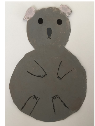
Emily L in year 3