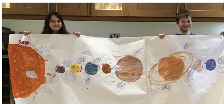
Grace in year 6